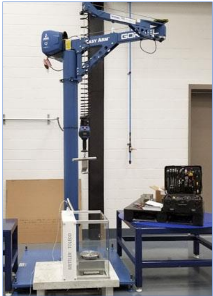
Balance and Jib crane for calibrating weights up to 50 pounds