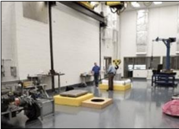
Large Mass Lab with Technicians installing large capacity balance.