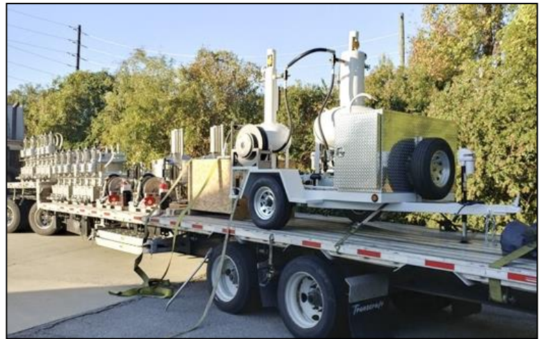
LP Test Unit