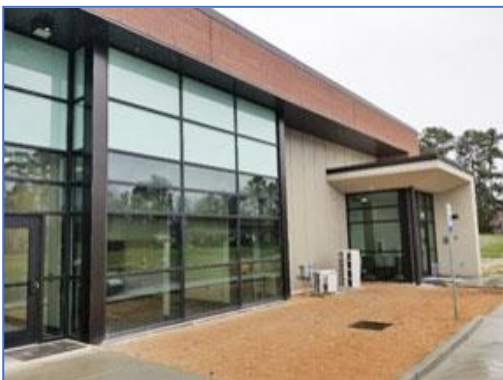
Metrology Lab Entrance

Construction of the new Metrology Laboratory has been completed. The installation of lab equipment is in process. After the equipment is installed, the metrology staff will make daily measurements for the next several months to obtain the data necessary for NIST Certification. The new lab will have all new equipment which will allow us to continue to operate while transitioning to the new lab without interruption of services.