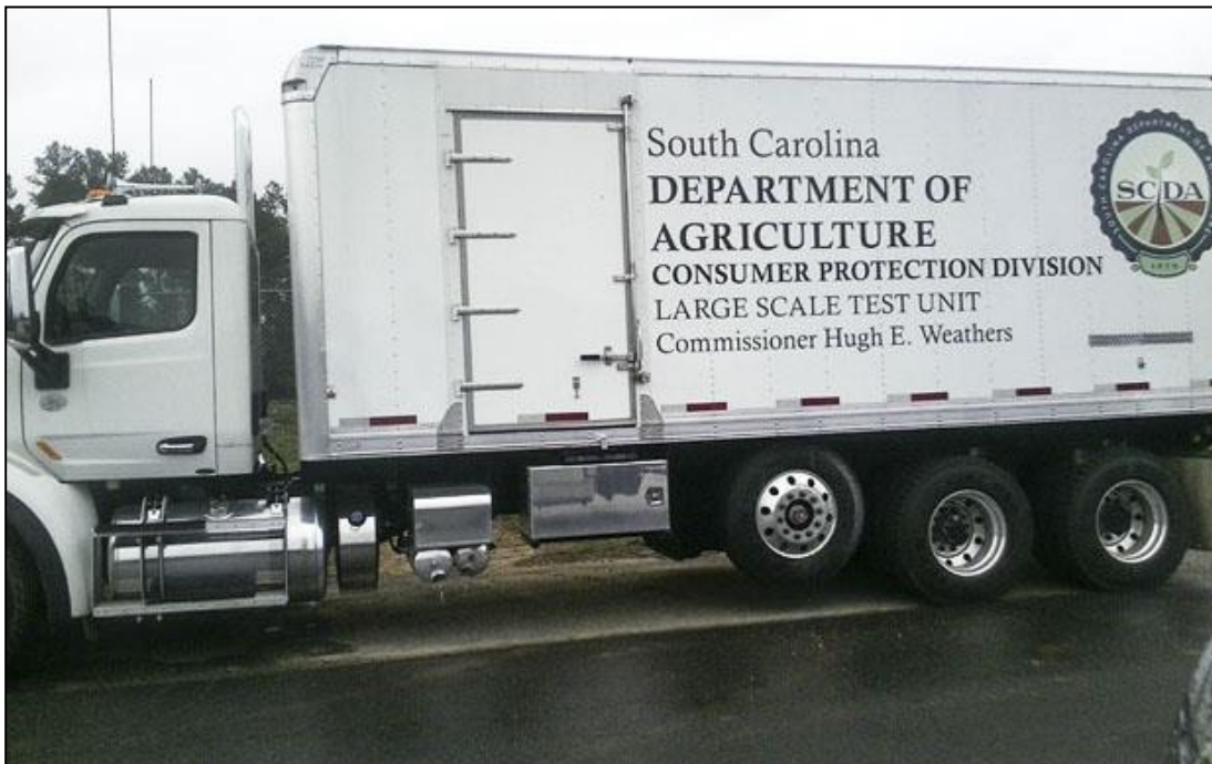
Scale Weight Truck