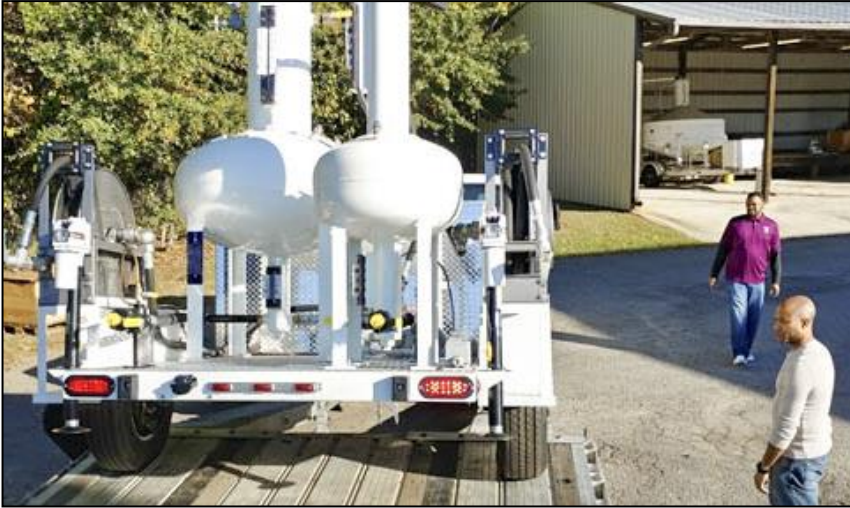
LP Test Unit