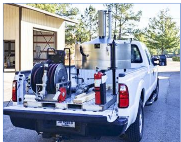
100-gallon skid mounted test unit

As of February 5, 2018, we are fully staffed with 23 inspectors.