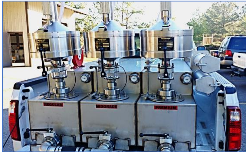
RMFD slide in test unit