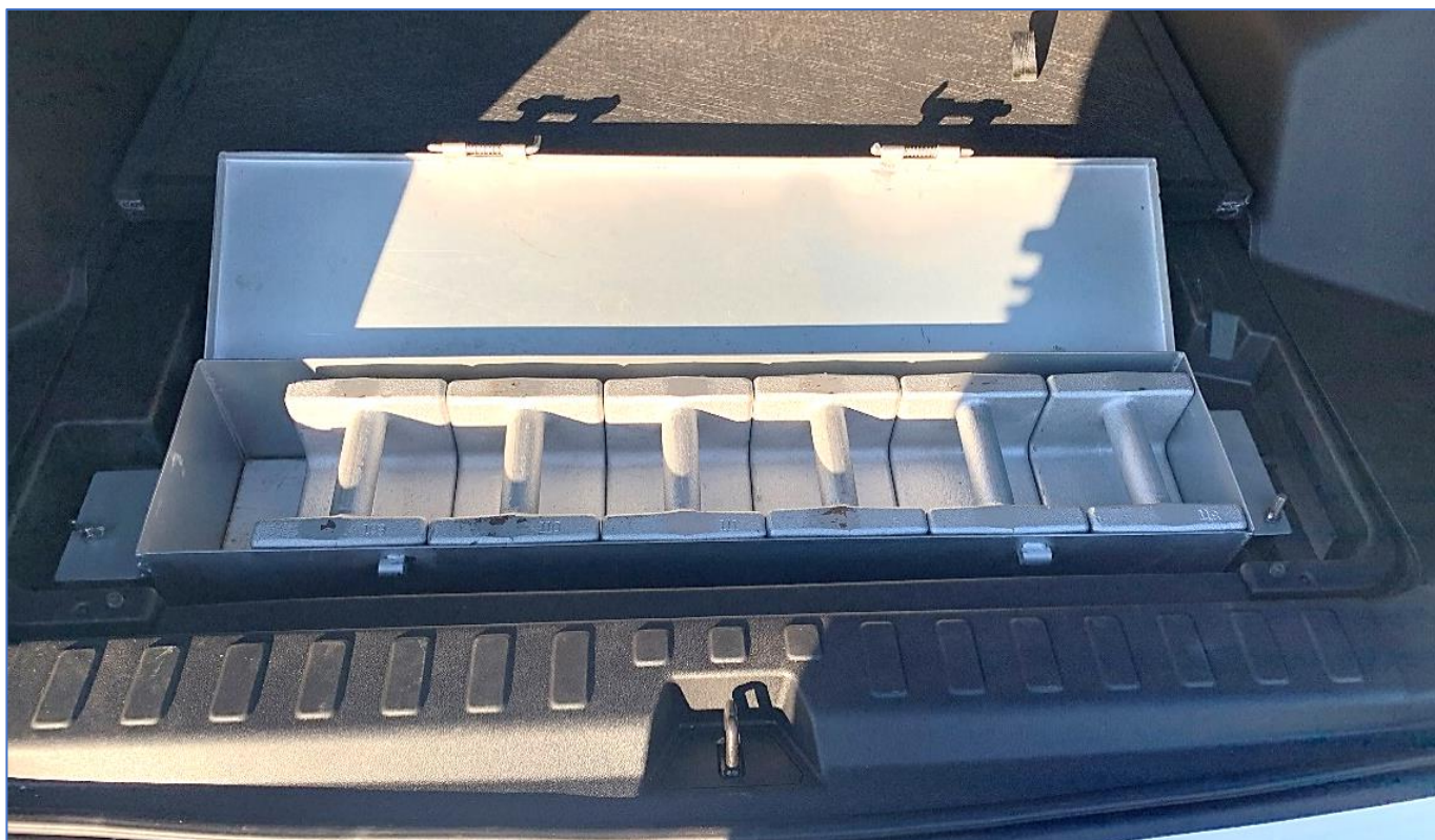
Pictured above is one of the boxes that we designed and installed in one of the new SUV's.