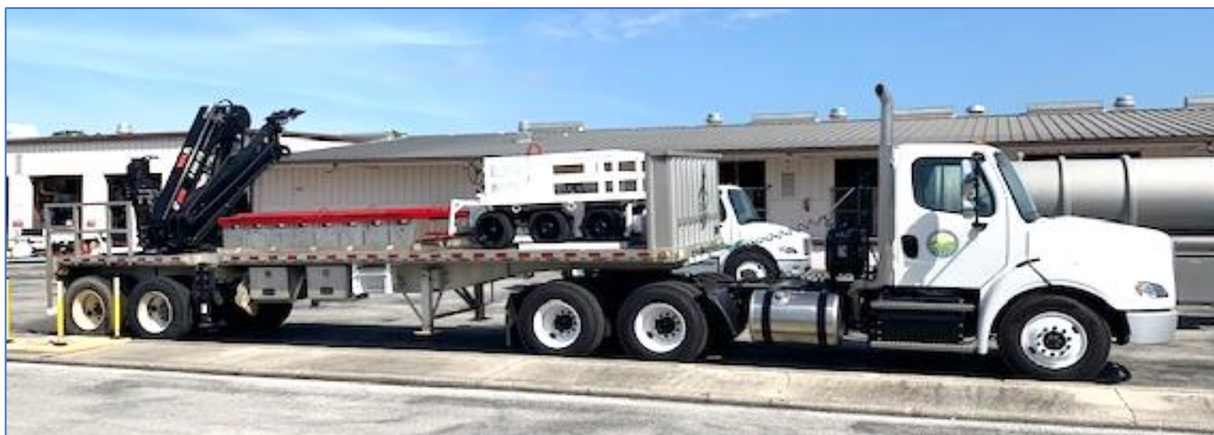
Here is one of our new Freightliner tractors that has been outfitted for use as a high capacity test unit. The Medium capacity units are still in the shop having the cranes installed but we hope to have them ready to roll very soon. 🚛